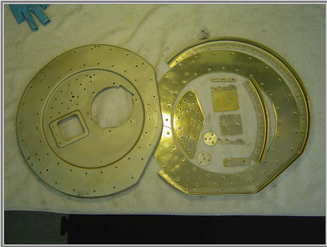
24569-000 PLATE, TYPICAL REPAIR COMPONENTS