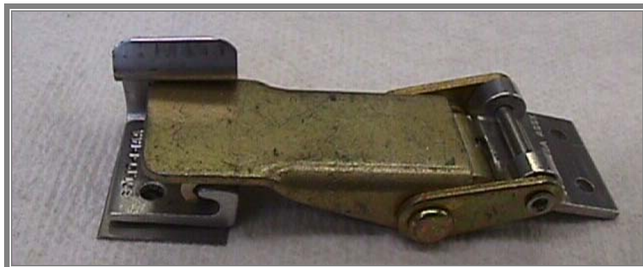
CAMLOC® STRIKE AND LATCH ASSEMBLY

THE CAMLOC® LATCHES ARE REPLACED WITH NEW AS NECESSARY [THEY ARE USUALLY ALL LONE-GONE] AND 3 ADDITIONAL CAMLOC® LATCHES INSTALLED INCREASING THE TOTAL TO 7. THIS ENHANCED CLAMPING AFFORDS BETTER SECURITY AND SEALING BETWEEN THE PLATE AND HOUSING, THUS IMPROVING LONGEVITY. PRICING IS SUBJECT TO INSPECTION WITH A TYPICAL REPAIR STARTING AT 15 HOURS [$50/HOUR]. POWDER-COATING AND THE CAMLOC® LATCHES ARE ADDITIONAL. YOU MIGHT EXPECT A SLIGHT INCREASE IN MANIFOLD PRESSURE DEPENDING ON HOW SAD YOUR HOUSING WAS PRIOR TO REPAIRS.