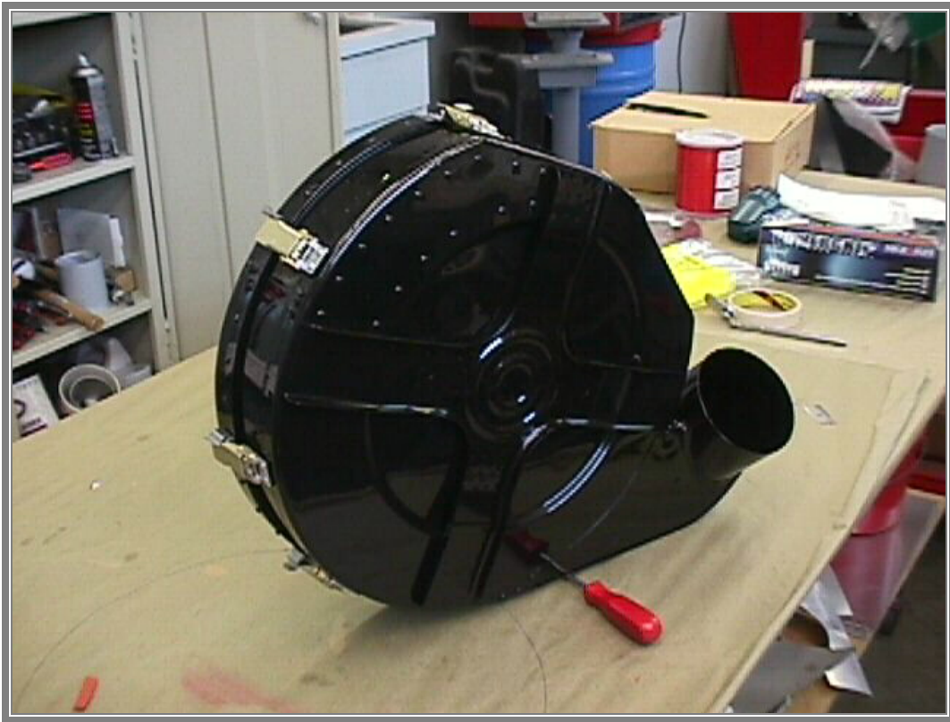
COMPLETED INDUCTION HOUSING ASSEMBLY