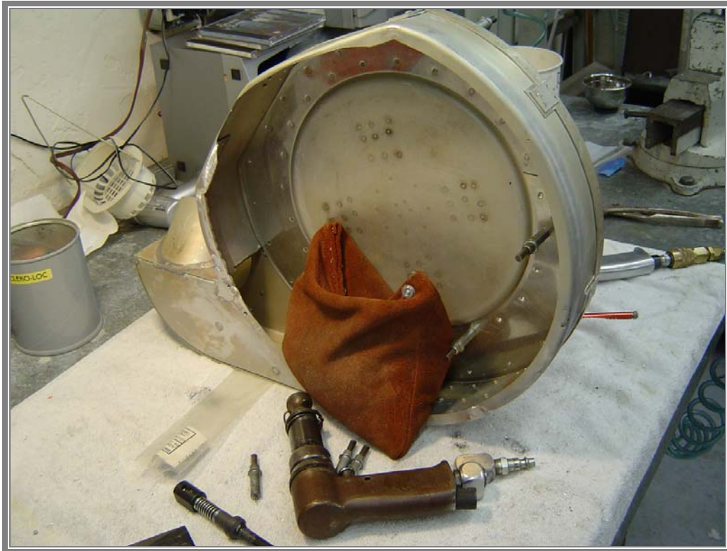
24568-000 BOX, TYPICAL REPAIR PROCESS