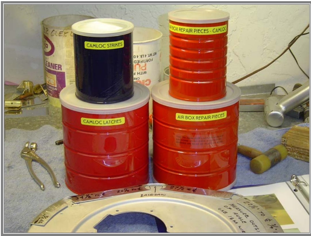
MORE MISCELLANEOUS STUFF