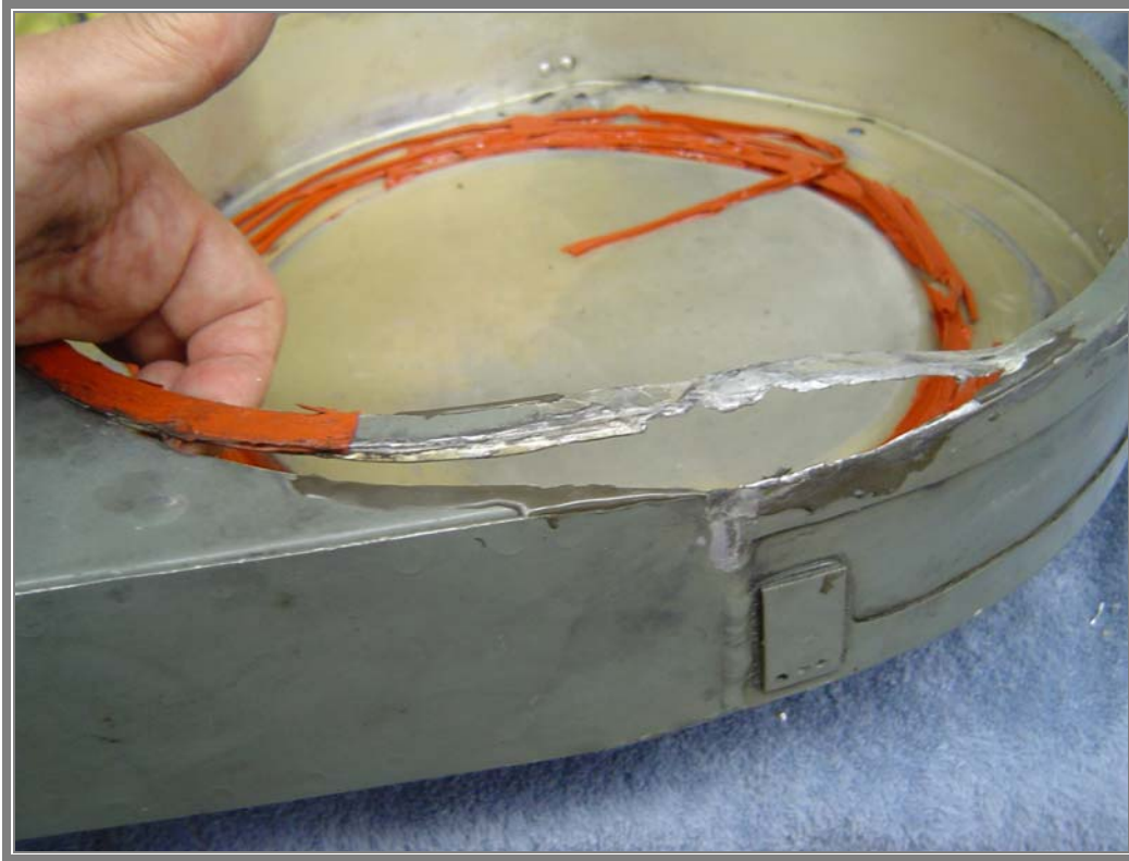
24568-000 BOX ASM, AS RECEIVED. NOTICE THE PRIOR "REPAIRS" USING EPOXY AND SILICONE