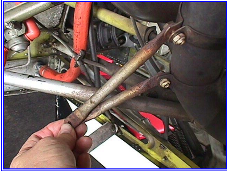
RIGHT SIDE MUFFLER SUPPORT TUBES AND CLAMPS POSITION

10340 REGENT CIRCLE ∞ NAPLES, FL 34109 ∞ MKURKE@COMANCHEGEAR.COM PHONE & FAX 239/593-6944 ∞ CELL 239/404-7524