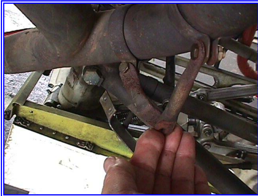
LEFT SIDE MUFFLER SUPPORT TUBES AND CLAMPS POSITION