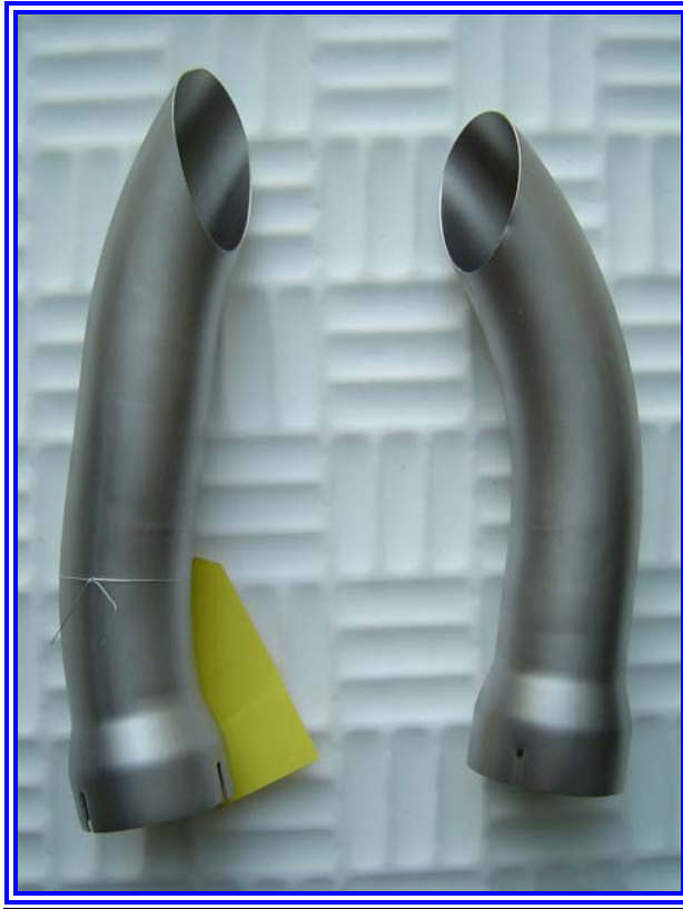
TAIL PIPES - RIGHT SIDE PICTURED ABOVE RIGHT

10340 REGENT CIRCLE ∞ NAPLES, FL 34109 ∞ MKURKE@COMANCHEGEAR.COM PHONE & FAX 239/593-6944 ∞ CELL 239/404-7524