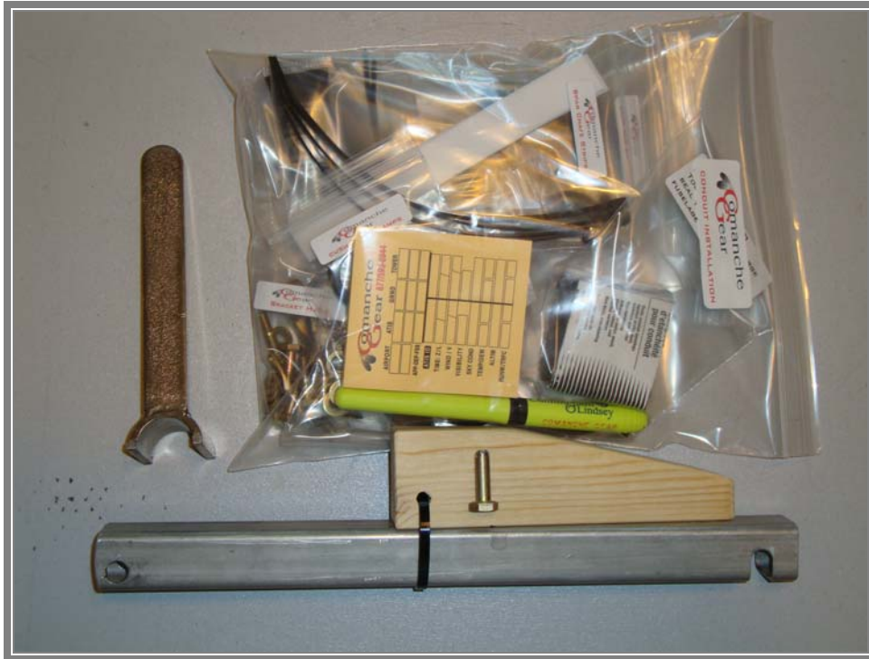
TOOLING AND BAGGIE CONTENTS

10340 REGENT CIRCLE ∞ NAPLES, FL 34109 PHONE & FAX 239/593-6944 ∞ CELL 239/404-7524