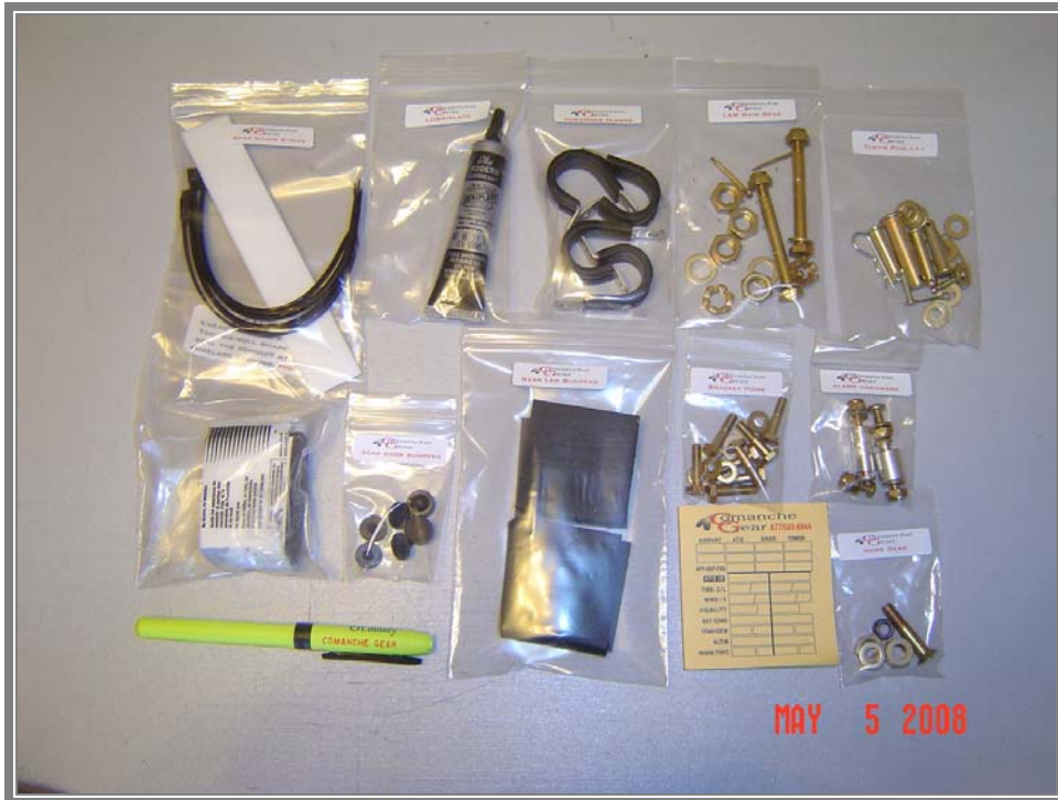
BAGGED HARDWARE PLUS OTHER COMPONENTS